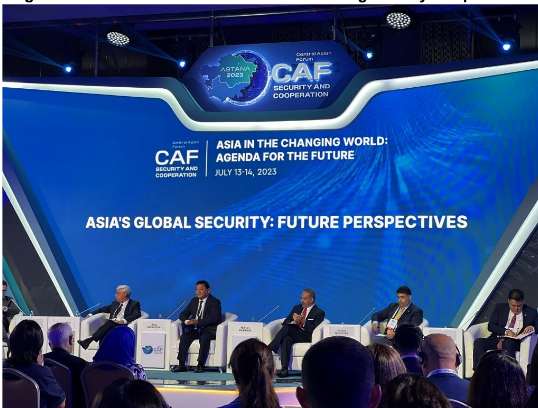
Figura N° 3 – “Foro Centro – Asiático sobre Seguridad y Cooperación”