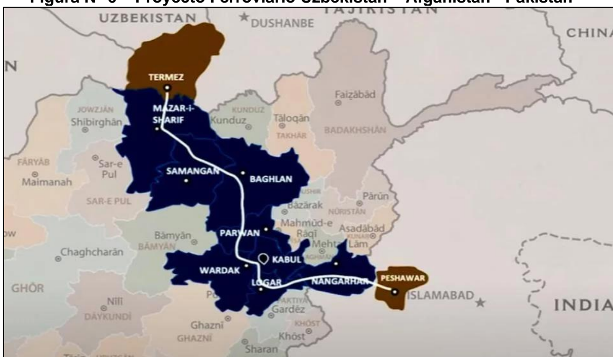
Figura N° 6 – Proyecto Ferroviario Uzbekistán – Afganistán - Pakistán