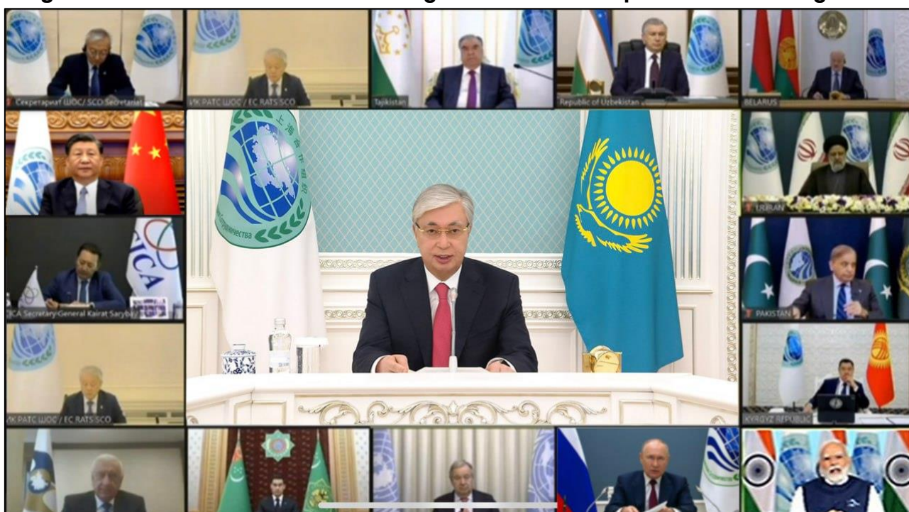
Figura N° 1 – Cumbre Anual de la “Organización de Cooperación de Shanghai”