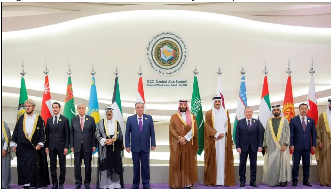
Figura N° 4 – Cumbre “Asia Central – Consejo de Cooperación del Golfo”