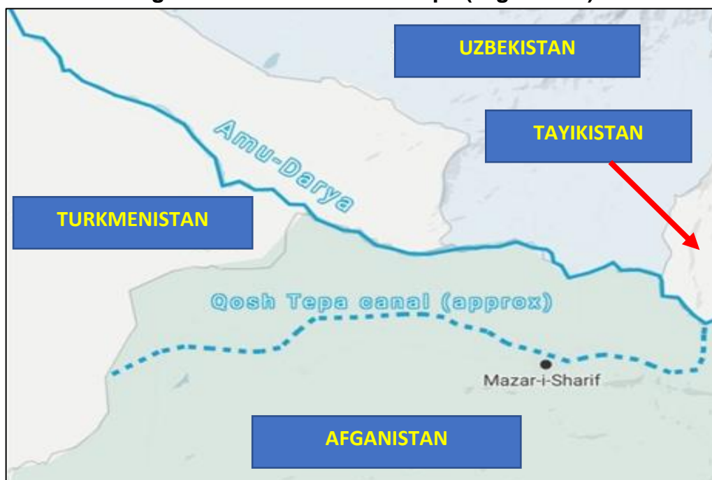
Figura N° 5 – Canal Qosh-Tepa (Afganistán)